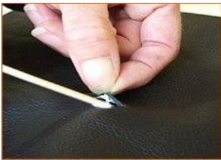
2. Glue underside of the leather to the subpatch.