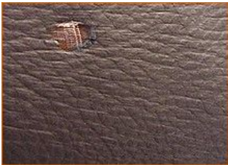
3. Ready for leather filler.