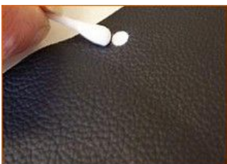
5. Clean and remove any residue of filler from the undamaged area using a damp cotton bud.