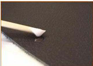
4. Apply filler to any gap that remains in the hole or rip.